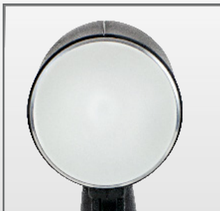
SVR™ Front View