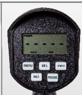
SVR™ Control Surface

Serving Law Enforcement for Over 60 Years