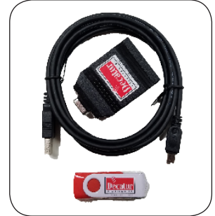
S792-625-0 EZ Stat Data Logger