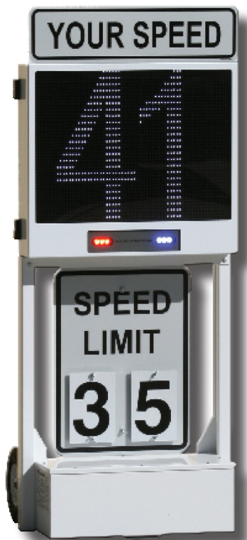
Shown with optional speed limit sign and red & blue flashers