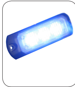
P792-39A, B, R or W Amber, Blue, Red or White High Visibility LED Flasher