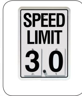
S792-522-0 Speed Limit Sign Kit