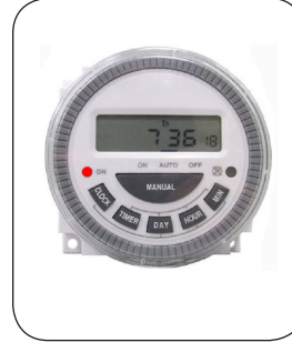
S792-60-0 Programmable Timer