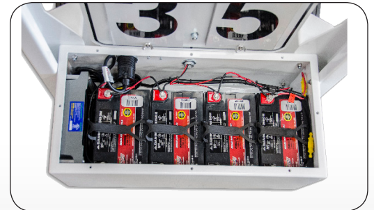
P702-15 (Up to 3 Extra Batteries)

Serving Law Enforcement for Over 60 Years